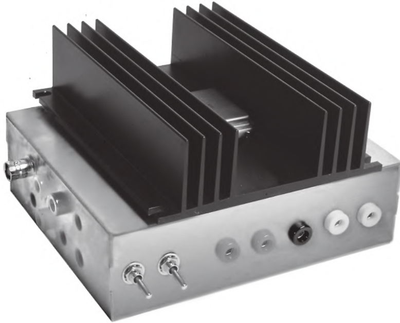
Figure 3: Inside of assembled box. Holes for components on long side were user drilled.